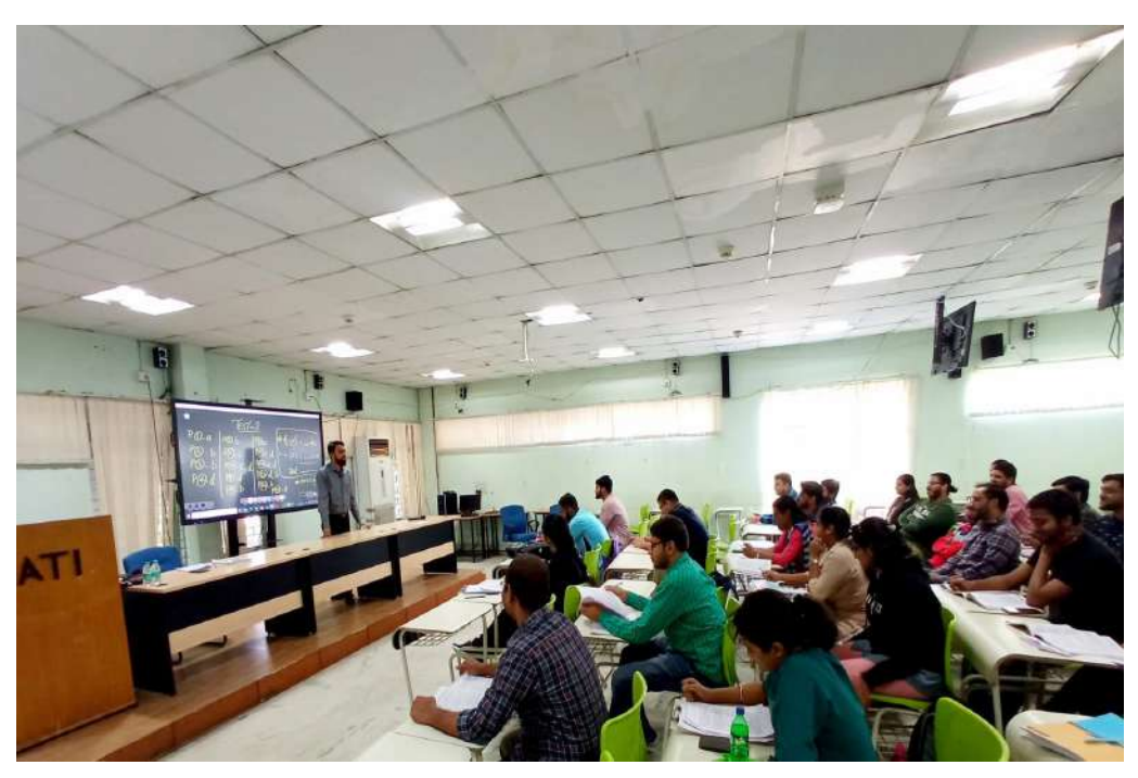
Ongoing Lecture (Section B)