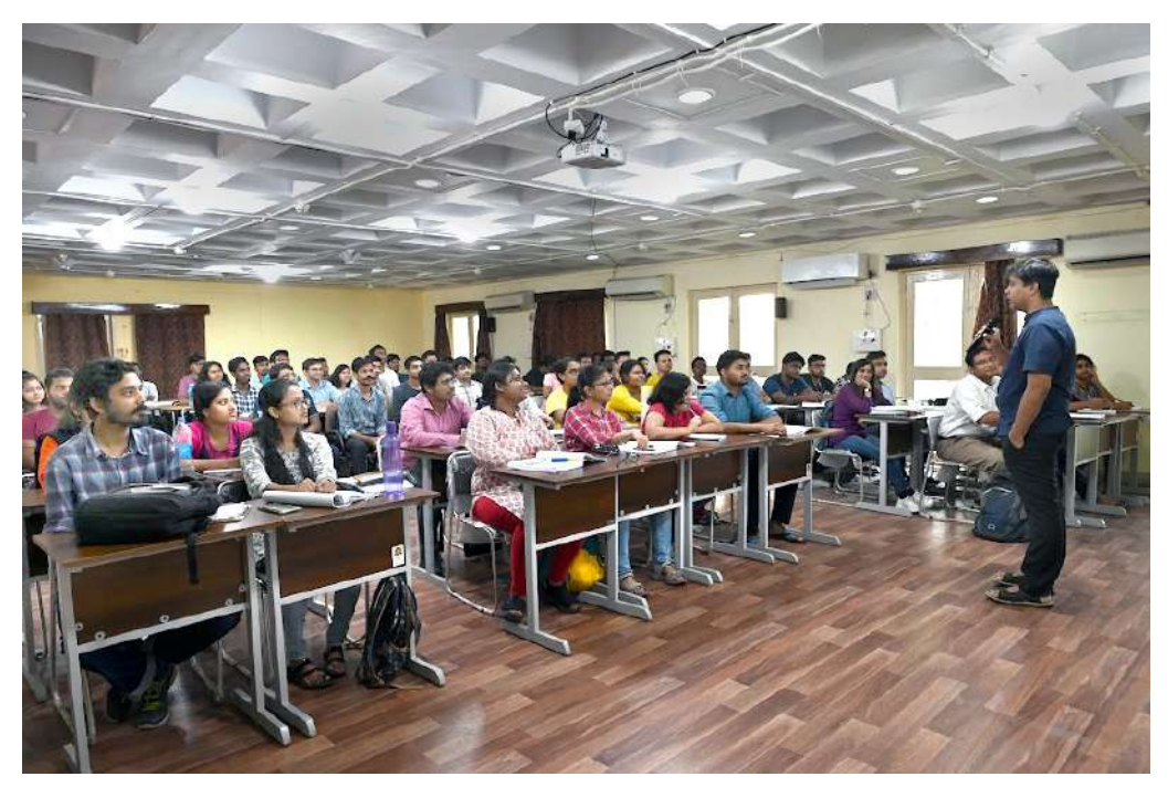
Ongoing Lecture (Section A)