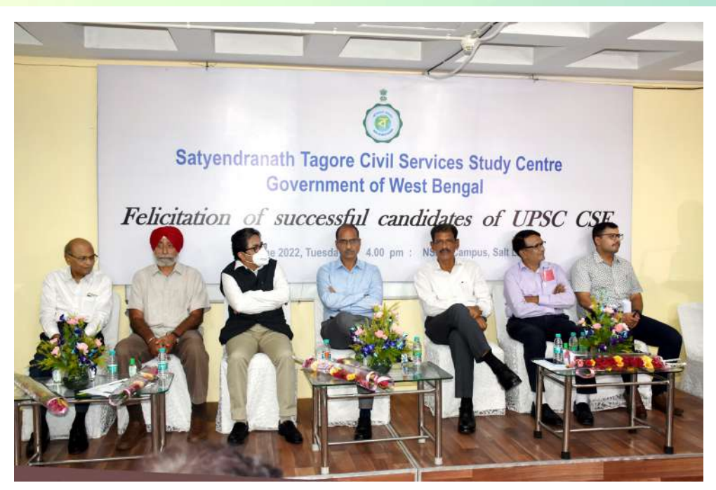
Dignitaries at the Felicitation of Six Successful Candidates of West Bengal in UPSC CSE 2021