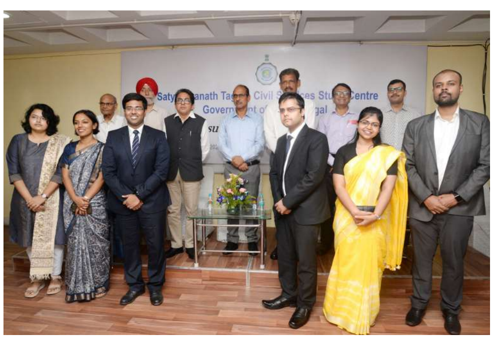
Six Successful Candidates at UPSC CSE 2021 along with the Dignitaries at the Felicitation Programme