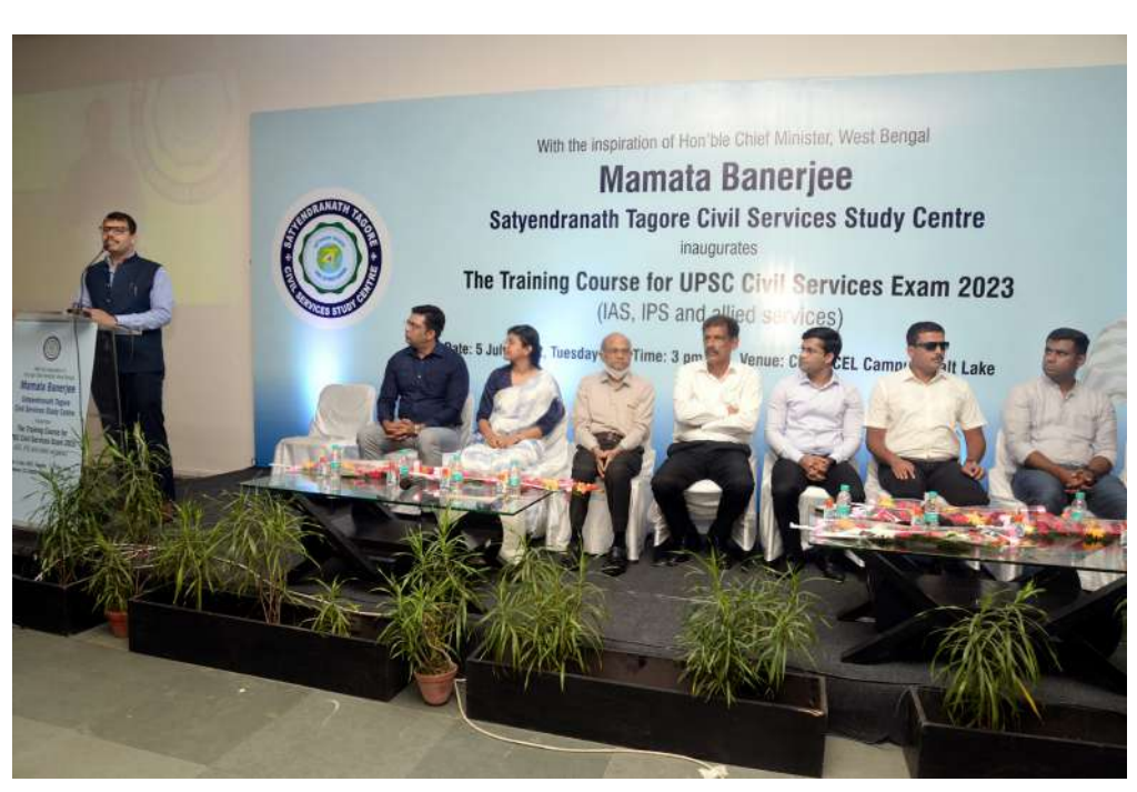
Inauguration of SNTCSSC 2023 batch