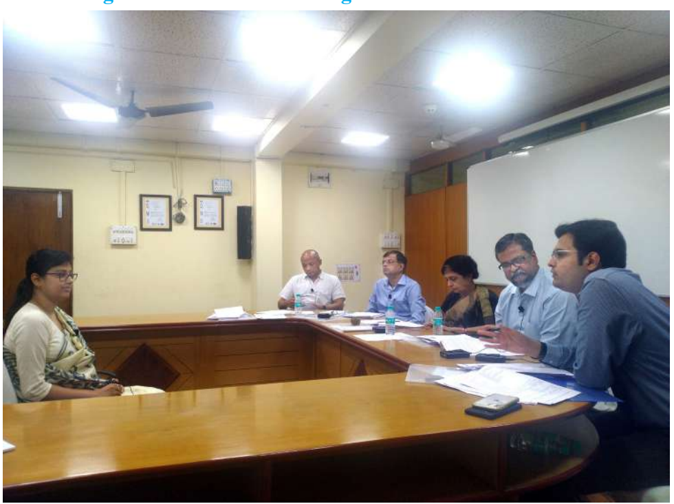
Ongoing Mock Interview Session