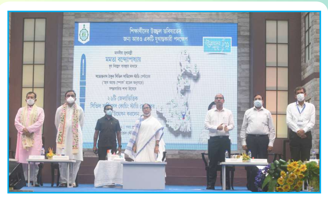
Hon'ble Chief Minister of West Bengal inaugurating the 26 District Study Centres